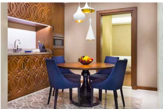
DINING AREA - EXECUTIVE SUITE