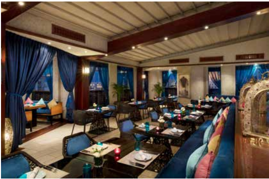
AL MATBAKH RESTAURANT

Al Matbakh: Modern Indian cuisine and rooftop views of the Corniche waterfront await. Stylish contemporary dining reaches new heights at Al Matbakh, our rooftop restaurant overlooking the Corniche. Experience progressive Indian dishes and discerning shisha selections during the skyscraper sundown.