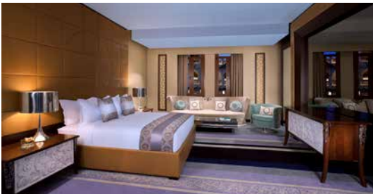
AMIRI SUITE BEDROOM

Al Jasra features all designer suites consist of 4 Amiri suites and 22 Jasra suites that are decorated and furnished with bold colours and rich materials by leading international designers.