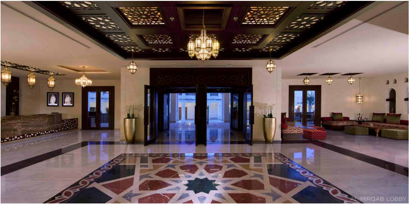
AL MIRQAB LOBBY