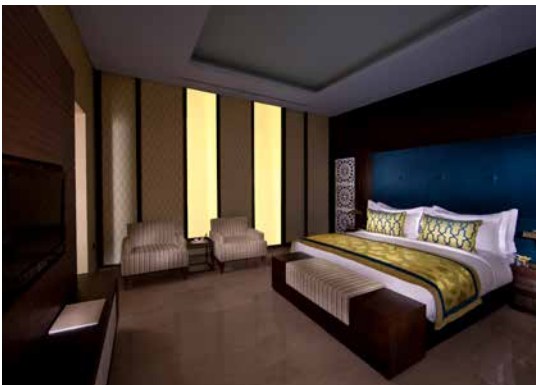
DELUXE SUITE - BEDROOM

Al Mirqab's 35 rooms and 2 suites are elegantly decorated and furnished to showcase modern Arabic design. Each room provides a unique combination of form and function for truly exceptional stays in Doha.