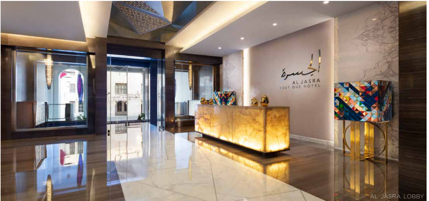
AL JASRA LOBBY