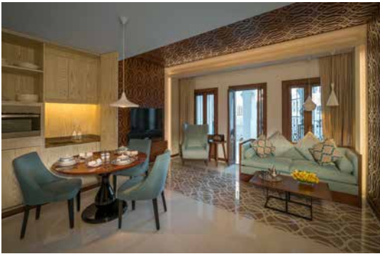
LIVING ROOM - EXECUTIVE SUITE

Bismillah Hotel is a historical gem, Doha's oldest hotel and the first hotel to be built in Qatar in 1950s. Once frequented by foreign traders, Bismillah is now Doha's best-known secret. The small property is an oasis of pure luxury and contemporary design, offering splendid views of Souq Waqif. Today the property is a hospitality landmark, updated with superb amenities.