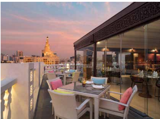
AL SHURFA ARABIC LOUNGE

Al Shurfa: Al Shurfa offers the ultimate serene dining experience, a rooftop restaurant with charming skyline vistas and a sunny outdoor terrace. Enjoy afternoon and evening meals enhanced by a cool breeze, or join us for a gorgeous Doha sundowner. Aromatic shishas, cold and hot mezze and more make for unparalleled moments of Arabian ambience.