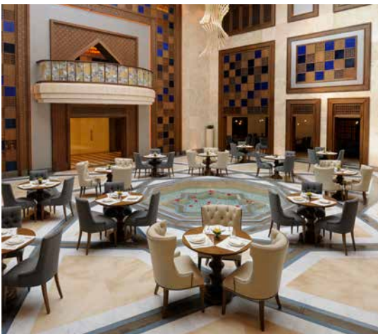
LA PIAZZA RESTAURANT

La Patisserie: La Patisserie offers a wide variety of homemade French delicacies and more baked by our patisserie chef. Order takeaway or sit down in the cafe, where tantalising aromas are wafting all day long.