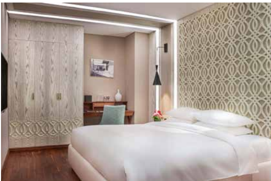
BEDROOM - EXECUTIVE SUITE

Bismillah offers just 2 luxurious executive suites, boasting total exclusivity and posh intimacy. Spread out in 100 square metres of space, with prestigious views of Souq Waqif from your own private balcony.