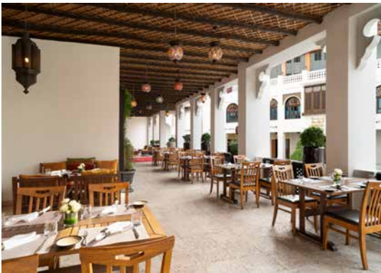
AL TERRACE RESTAURANT

Al Terrace: Indulge in the exquisite Georgian cuisine at Doha's first Georgian restaurant – Al Terrace. Georgia was the center of the famous Silk Route, connecting Europe and Asian worlds, making it an integral trade partner with Qatar.