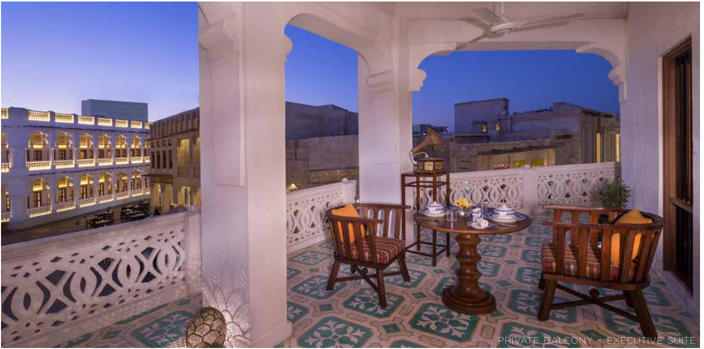
PRIVATE BALCONY - EXECUTIVE SUITE