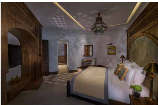
EXECUTIVE SUITE - BEDROOM