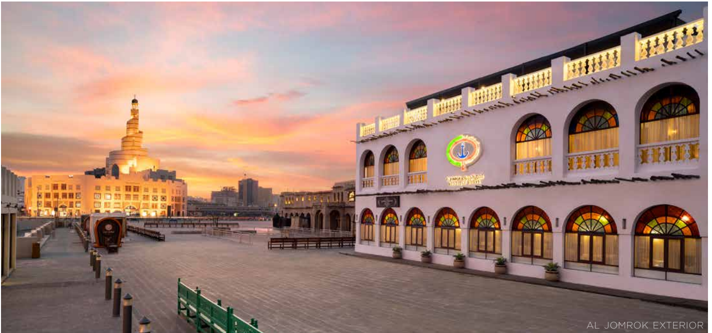
AL JOMROK EXTERIOR