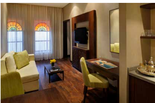
DELUXE ROOM - LIVING ROOM